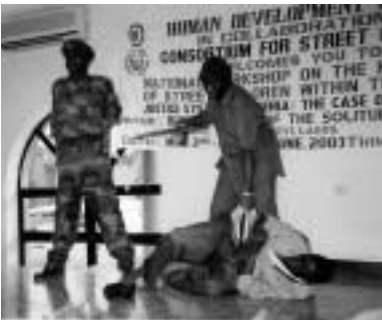
NIGERIA: drama depicting police violence against street children, presented as part of the National Workshop on Street Children and Juvenile Justice organised by Human Development Initiatives and Consortium for Street Children, 2-4 June 2003.

By far the most common experiences of street children with the police are overwhelmingly negative, characterized by psychological, physical and sexual violence and arbitrary abuse of power, whether on the streets in the context of harassment, or in police stations following arrest.