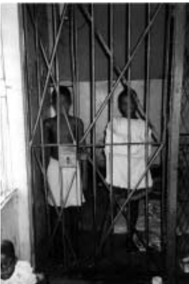
NIGERIA: 'Lost and found' children at Alakara 'Juvenile Welfare Centre', Lagos, Nigeria, June 2003. (Faces have been obscured to protect identities).