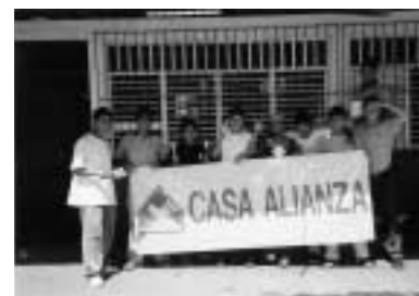
NICARAGUA: some staff and young people from the NGO Casa Alianza Nicaragua, April 2002.