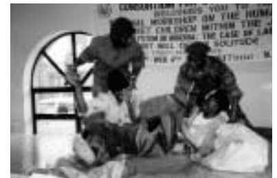
NIGERIA: drama depicting police harassment of street children, presented as part of the National Workshop on Street Children and Juvenile Justice organised by Human Development Initiatives and Consortium for Street Children, 2-4 June 2003."

Street children as part of the project in Pakistan reported that policemen regularly harass them for 'protection' money – i.e. a bribe that would allow the child in question to continue their survival strategies without interference. Some demand a share of the profits made by child vendors or extort an illegal 'fee' before allowing them to tout for business in their areas of patrol; others simply wait until the child has made a sale, and then snatch the money on the grounds that the child is 'a drug addict' and 'involved in crime'. Many children are arrested on false charges and then offered release on payment of a fine. Street children also report that police use false arrests to get children to do odd jobs for them. This usually involves the child being detained for a